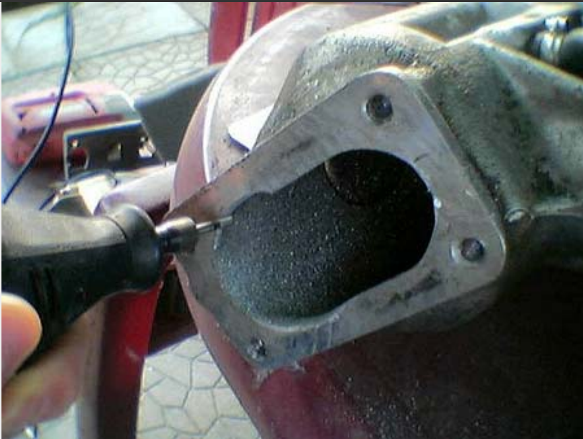
This is the bored opening nearly to size.