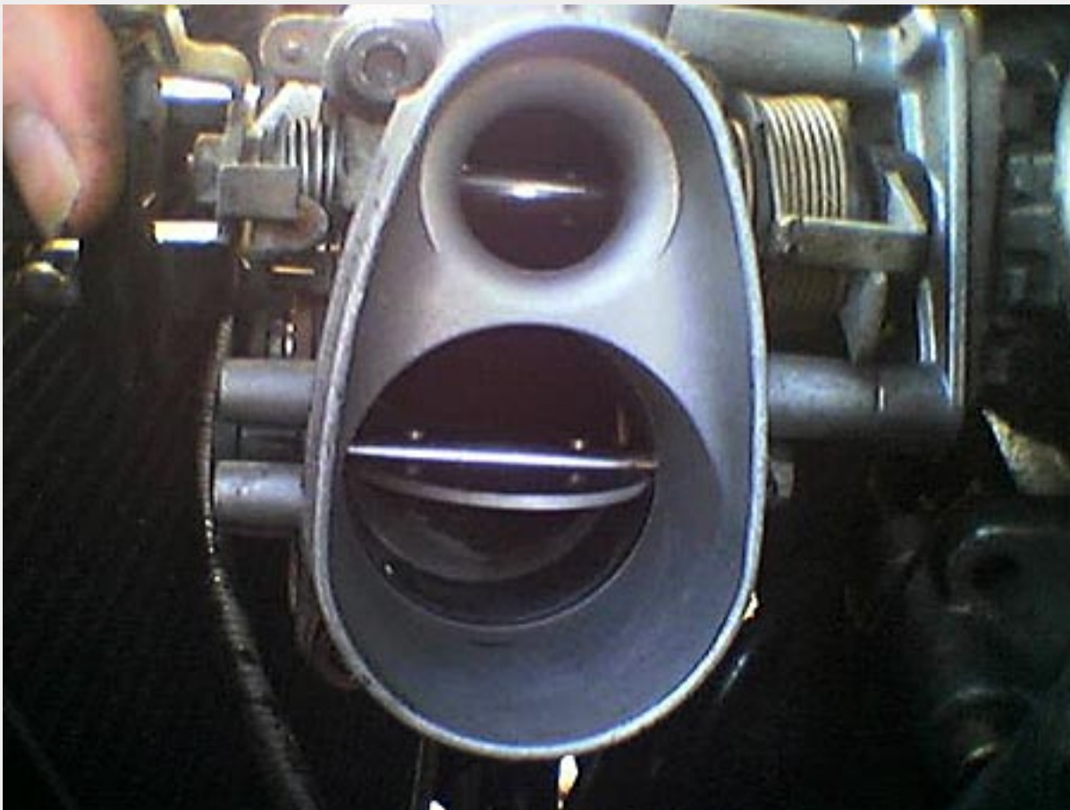
VAG throttle body in place

All modifications should be declared to your insurance company.